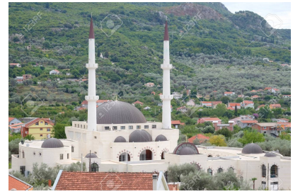
Mosque in Bar, Montenegro