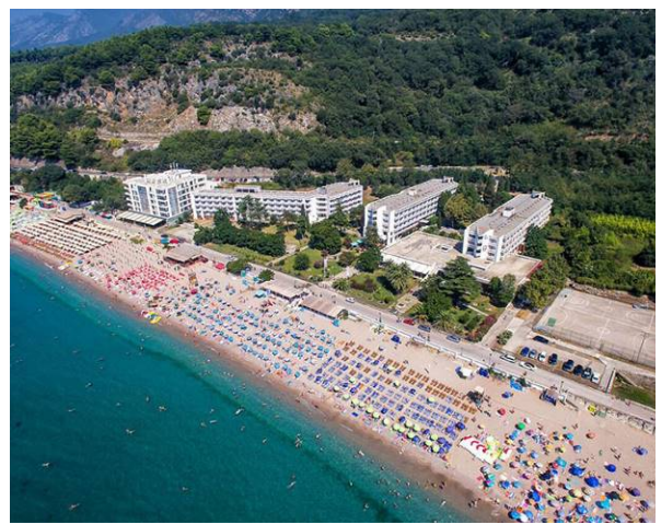
Some of the beautiful natural sandy beaches in Bar and surrounding Bar (Summer season since 1st May to 1st October)