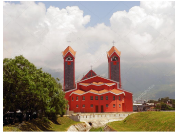
Catholic Church of St. Peter the Apostle, Bar, Montenegro