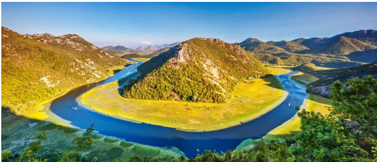
Skadar Lake close to Bar