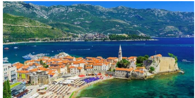
The City of Budva - Leading Tourist Resort (20 km away from Bar - north)