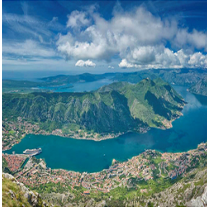
The Bay of Boka Kotorska with shore side around 100 km long - 50 km away from Bar