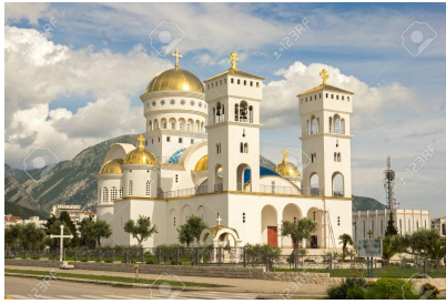
Orthodox Church of Saint Jovan Vladimir in Bar, Montenegro